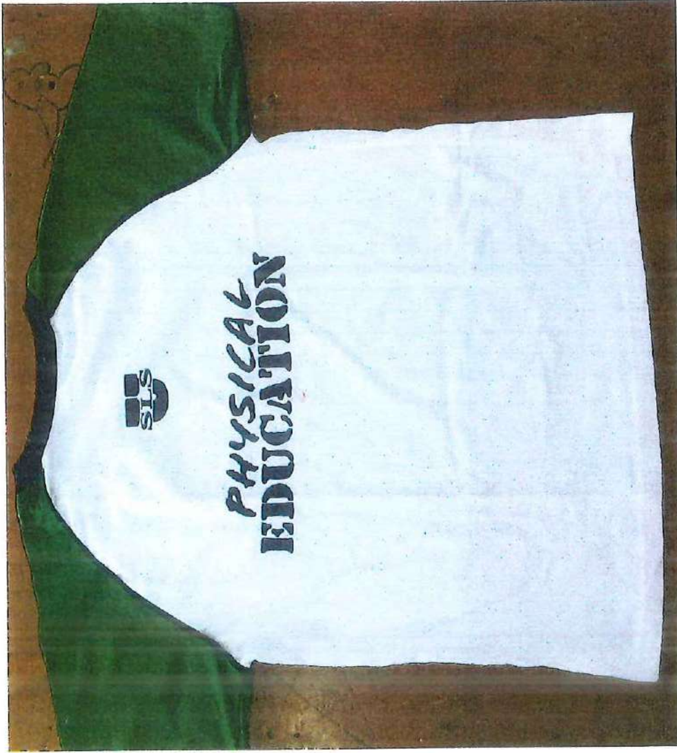
Back bodice of PE T-shirt with print of Physical Education at the back 2 ½ x 9 ½ inches. Raglan sleeves-emerald green with black piping in the sleeves. SLSU acronym at the back.