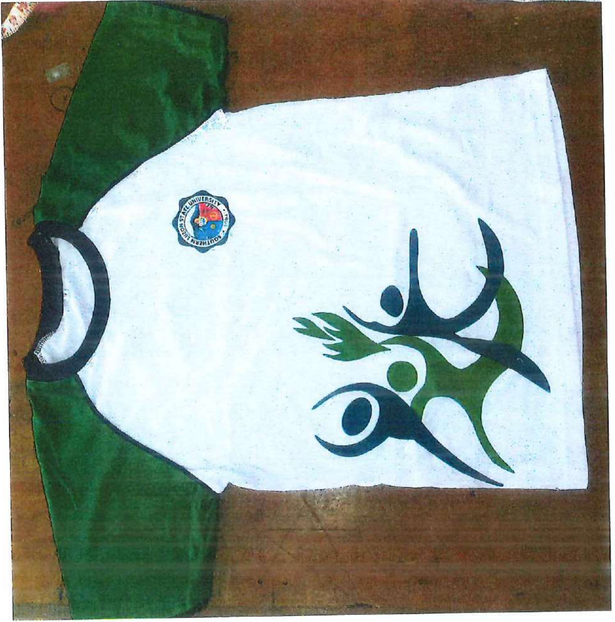
Front Bodice of PE T-shirt for college students with SLSU logo in the left bustline 2 1/2 x 2 1/2 inches. Round collar with 1/2" black piping. The textile for T-shirt is CVC 50-50 cotton. IHK logo in the lower right side of shirt 12" x 12" semi rubberized print.